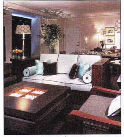
ABOVE: The San Diego Zoo, Wine & Roses Hotel Restaurant & Spa, and Hotel Solamar

purveyors will have you and your honey appreciating the simple things in life...not to mention four delicious varieties of goat cheese fresh for sampling. They even have goat milk skincare products! harleyfarms.com