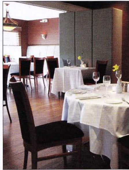
TOP ROW: Jsix Restaurant – San Diego, Half Moon Bay, and Wine & Roses Hotel Restaurant & Spa MIDDLE ROW: Wine & Roses Hotel Restaurant & Spa, Half Moon Bay Inn Private Patio, and San Diego Gas Lamp District BOTTOM ROW: The Ahwahnee Hotel, Sycamore Mineral Springs Resort, and Wine & Roses Hotel Restaurant & Spa